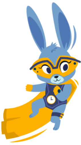
ALWAYS ON TIME TONI