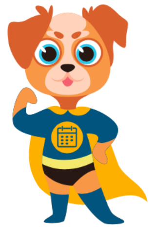
ALWAYS IN SCHOOL SANDY

"Our school starts at 8.45am; that's when the doors open!